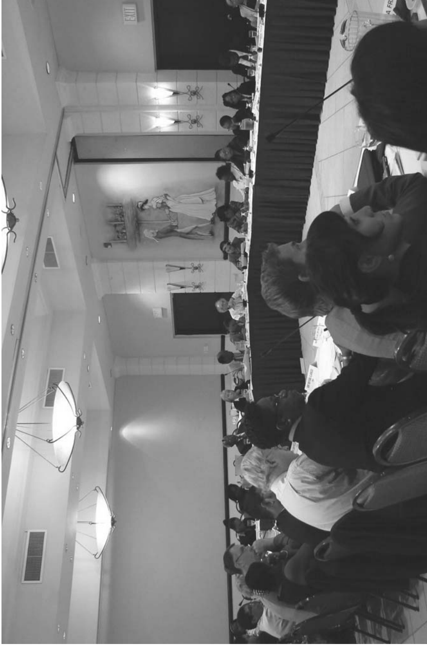
Delegates at the UPR seminar for Commonwealth Caribbean countries, Barbados, October 2008.