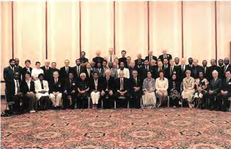
April 1994 – The Commonwealth Observer Group of 60 core members for South Africa's historic first non-racial democratic elections. The chairperson is the Rt Hon Michael Manley of Jamaica (seated centre)

Commonwealth Heads of Government Meeting Liaison Committee Meeting on administrative arrangements for the Auckland summit, March 1995, London, Britain. Attended by representatives of