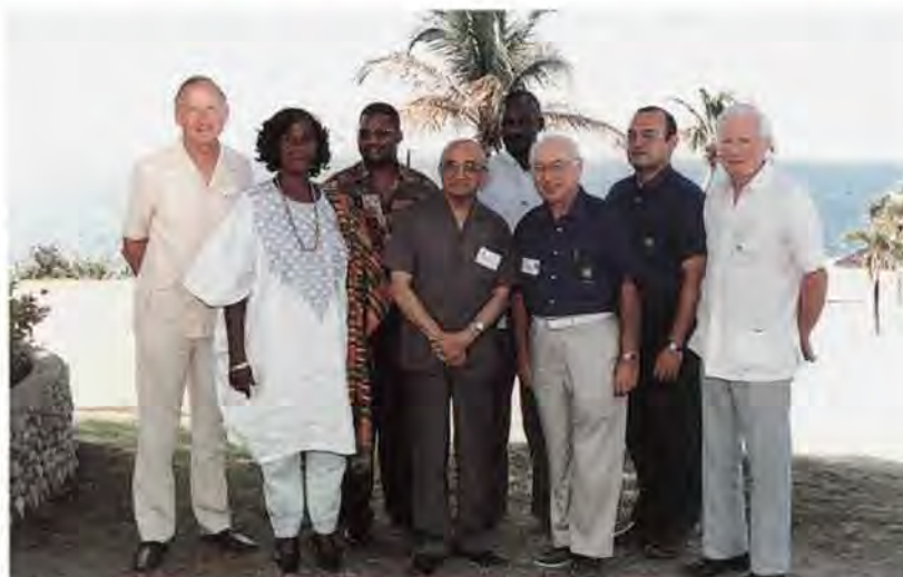
July 1995 – In St Kitts and Nevis for the elections, Mr Justice P N Bhagwati of India (centre) leads the eight-member Commonwealth Group