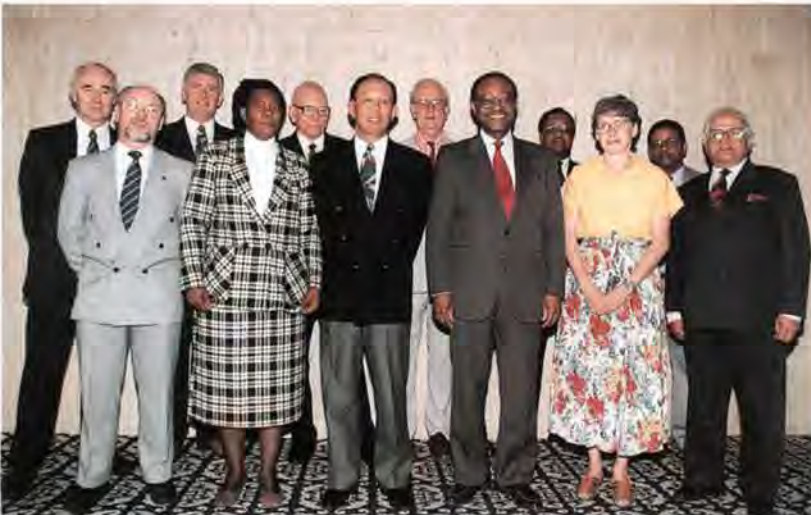
May 1994 – The 11-member Commonwealth Observer Group for the Malawi elections after being briefed by the Secretary-General (front, third from right). On his right is the chairperson of the group, Dato Musa Hitam of Malaysia